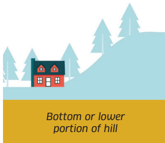
Bottom or lower portion of hill