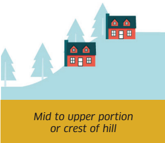
Mid to upper portion or crest of hill